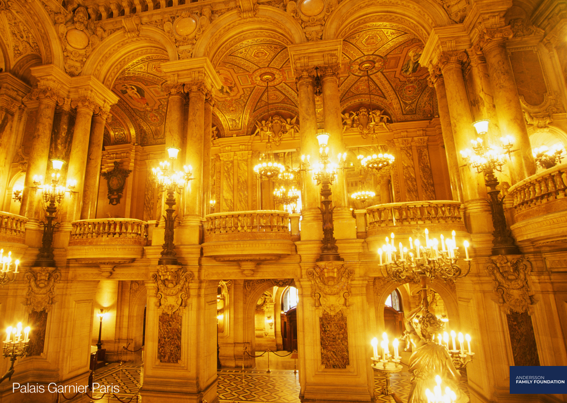
Palais Garnier Paris